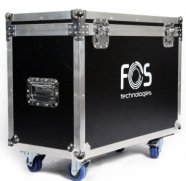
FOS Double Case Scorpio Beam

Double case with wheels for 2 pcs Scorpio Beam.